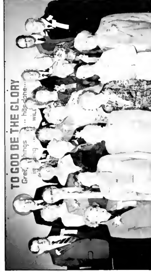
OBC Golden Miter Class of '39 more than $6,000 to date to various OBC/OTS projects.

Various classes held reunions. Those classes that have responded, have dona-